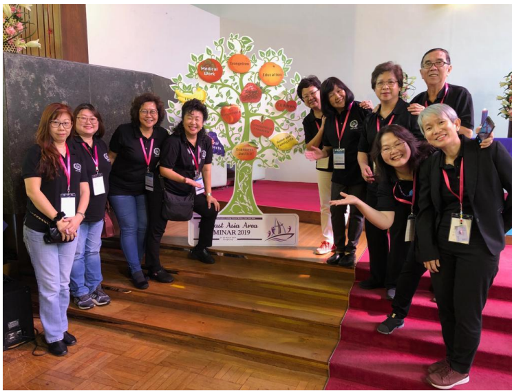
2021-2026 New EAA Committee