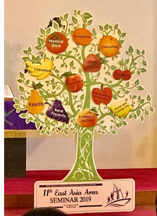
Tree of Life, with 12 fruits